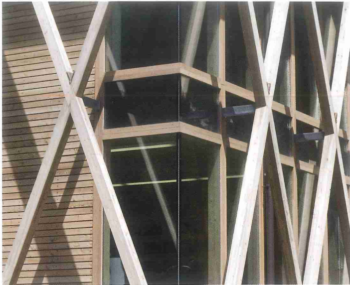
↑ Detail façade ← Second floor plan