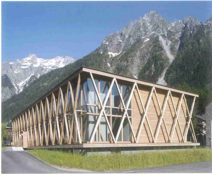
↑ North-west view ↓ South-west view